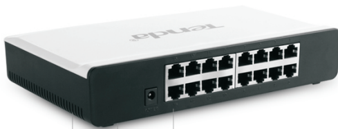
Side Vent Bottom Vent 94V0 Fireproof Plastic Housing